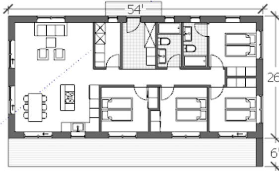
Desert 1400 Ft2