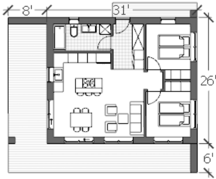
Creek 800 Ft2