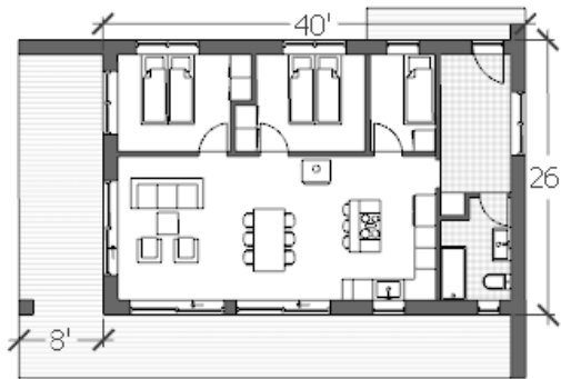
Waterfall 1040 Ft2