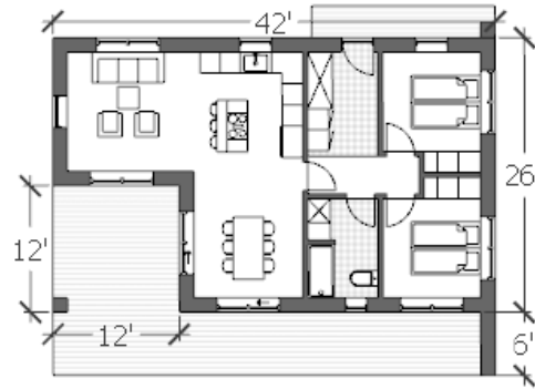
Forest 950 Ft2